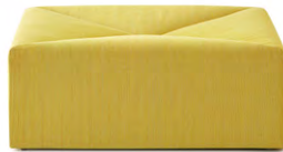
yellow/ocre/light green 00AMRF2-B